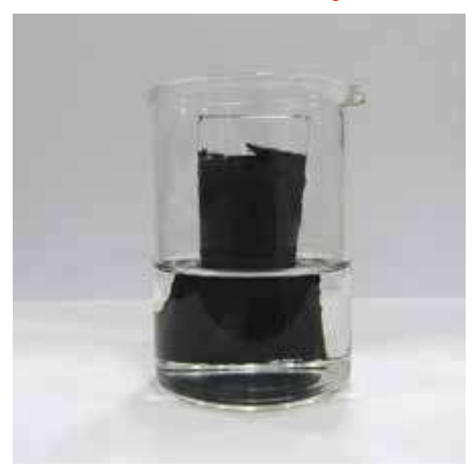
SYNTH HTL STEAM PLUS